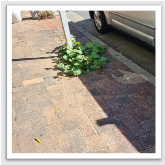
Melbourne Street general weeds identified Photo 14.