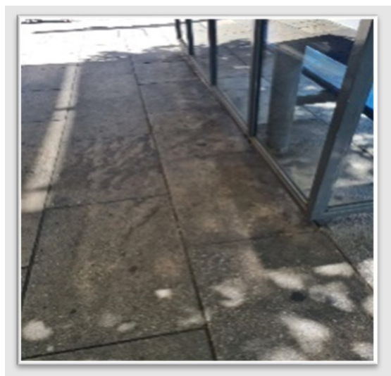
King William Before Photo 1.